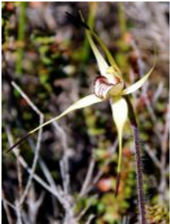
One of the treasures at Cullen Reserve is the endangered Little Dip Spider-orchid ( Caladenia richardsiorum ).

In addition to the Moorunde mallee reserves, we manage and maintain Cullen Reserve , a 29ha property adjacent to Lake Fellmongery, near the town of Robe about 300km southeast of Adelaide.