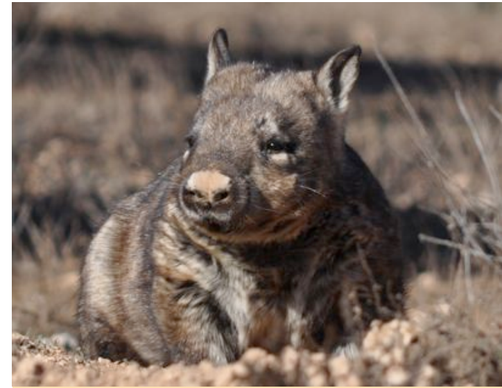
Southern Hairy-nosed Wombat (Lasiorhinus latifrons) at Moorunde Wildlife Reserve.

Regular Society events include Visitor & Volunteer weekends held once a month at Moorunde. Volunteers conduct weeding, animal surveys, fence repairs and general maintenance. Visitors are welcome so why not come along? Contact us for details.