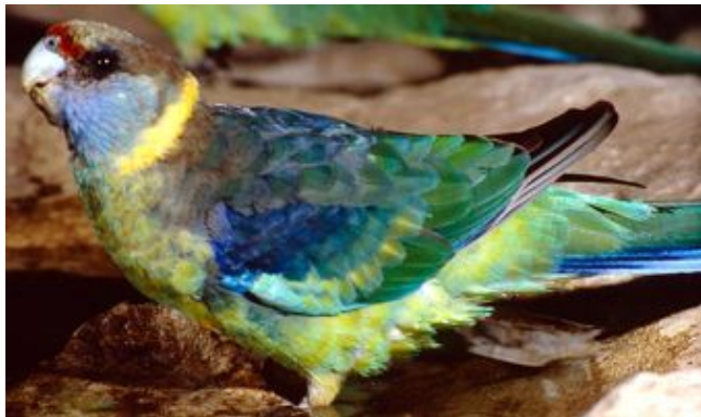
Mallee Ringneck Parrot ( Barnardius barnardi ) – one of the many delightful bird species found at the Moorunde Wildlife Reserve.

Like us on Facebook for frequent news and updates of our projects and activities. www.facebook.com/nhssa